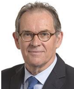
Alain CADEC Chair of Committee on Fisheries